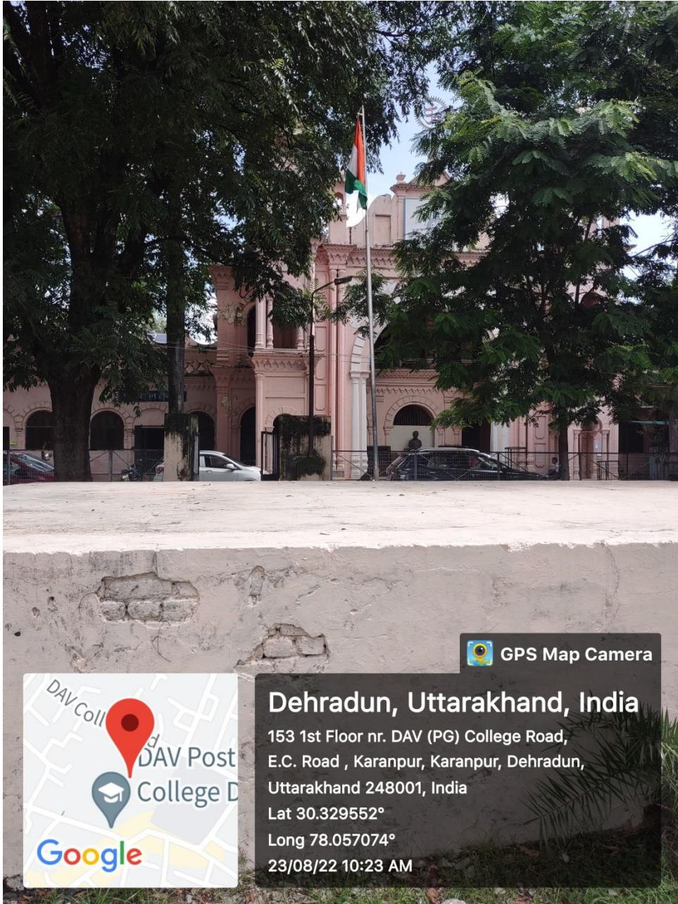
Daily Flag Hoisting