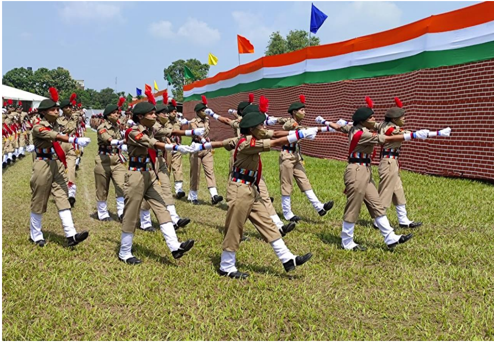
Celebration of Independence Day in the college and participation of college NCC cadets in Uttarakhand state Independence Day parade