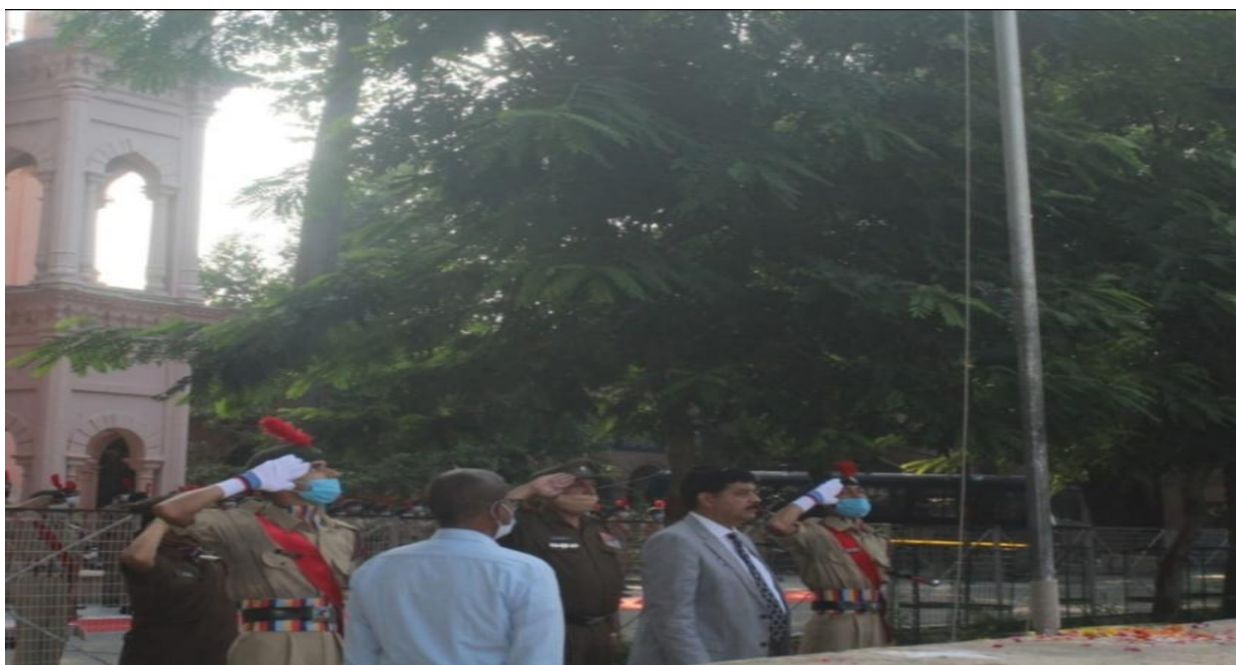
Celebration of 73 rd Republic Day in the college campus